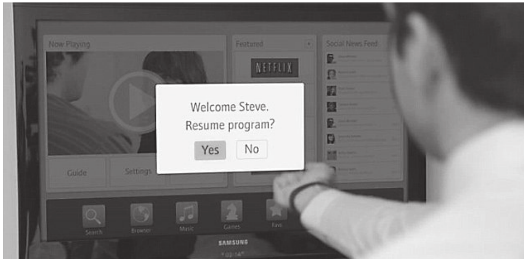
Figure 3: LOKI user authentication

The LOKI also contains sensors that tell a device, such as your cell/mobile phone, how far away you are from it, and lock it if you are not holding it. However, once you are holding the cellphone the LOKI can unlock it without a password. Some LOKI users are considering using it to control all the devices in their smart homes, such as their lighting, heating and other electrical devices.